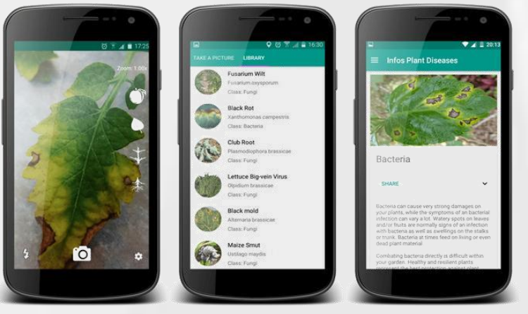
Mobile Application Example

We continue to develop web-portal. Section for users, experts and researchers will be open soon. We are going to present draft mobile application in second half of 2019.